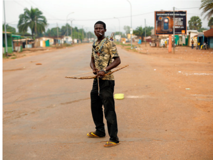
An Anti-Balaka fighter with a bow and arrow stands in the Miskin district of Bangui, where many Muslims have fled and many businesses have been looted.

The Anti-Balaka couldn't start the fight in Bangui; the Séléka were too strong. We had to start in the countryside. We walked from Bangui to a small village west of Damara—that's where we meet with a large group of Anti-Balaka. No one called us to join them; we heard on the radio where the fighting was and we moved towards that area. 78