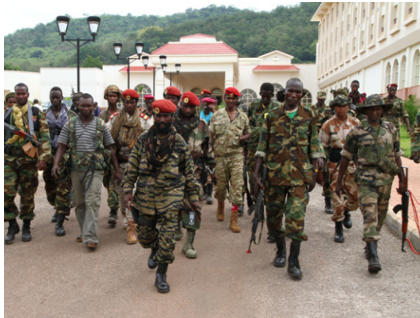
Séléka fighters walk in front of the Hotel Ledger Plaza Bangui on March 27, 2013, soon after taking control of the capital.

International pressure forced Interim President Michel Djotodia to step down in January after an emergency parliamentary summit hosted in the Chadian capital of N'Djamena. 27 Following Djotodia's departure, tensions escalated in Bangui, and Séléka fighters and Muslim civilians began to flee toward the north. 28 Senior Séléka leaders fled the country, and the alliance has broken into several smaller armed groups with limited central command. Many of the Séléka fighters have retreated to their stronghold in the central and northeastern part of the country that borders Chad and Sudan. An estimated 3,000 to 4,000 Séléka fighters, however, remain confined to military barracks in Bangui under the control of AU forces. 29